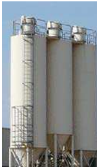
Level control in silos