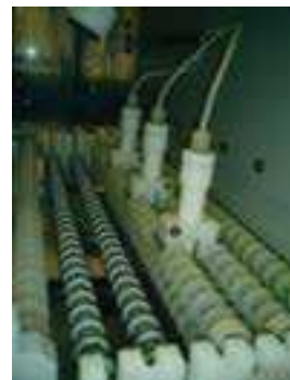
Series 26 - Level control at circuit board production