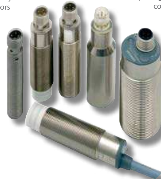
sedimentations are mini-

As pioneer of the capacitive level control in the plastic industry we offer capacitive sensors that are able to detect bulk materials with low dielectric constant (DC) and low material density. Excellent ESD protection and EMC characteristics which are far over the NORM values ordain these sensors for such kind of applications. With the use of antistatic plastic, like PTFE, for the sensor body, material