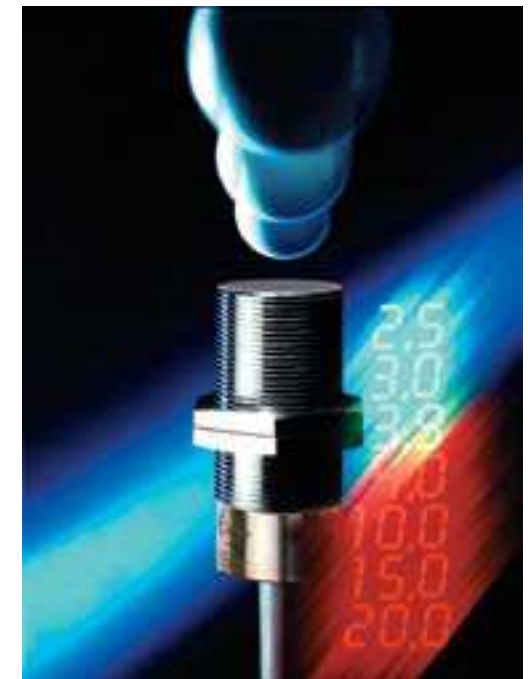
Capacitive sensor with 4...20 mA analogue output

For the selection of the sensors first it is important to know if detection should be made with the sensor in contact with the material or at a distance or through a container wall.