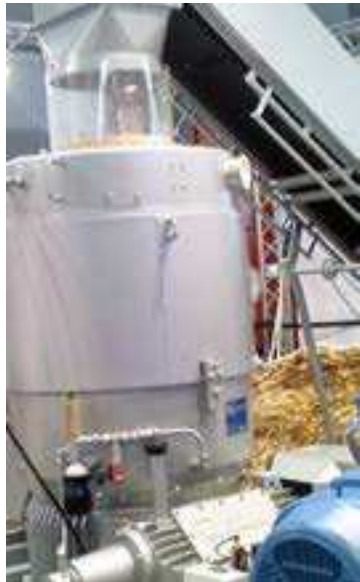
Level control of wood chips