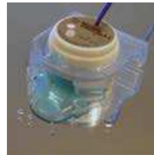
Leak-Sensor - for detection of leaks

So-called LEAK-Sensors for detection of leaks are also included in this range.