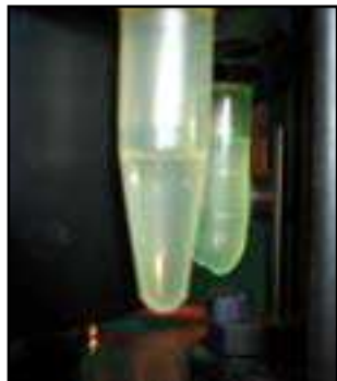
Level control of liquids in Ampoule.

For conductive substances that are often found in the semiconductor industry, we have modified sensors on offer.